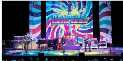
Spotlight Central in Spotlight Central