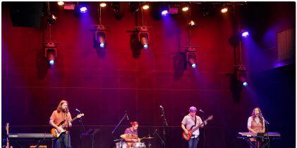
Spotlight Central in Spotlight Central